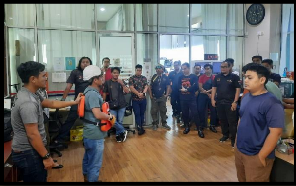
TOOLBOX MEETING – PPE AWARENESS 4.7.2023