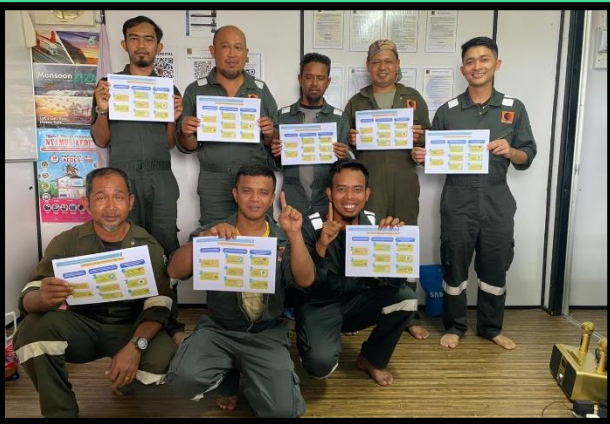
EYE PROTECTION TRAINING PDSC 15.8.2023