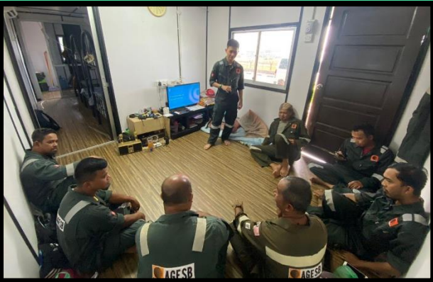
HAND AND FINGER INJURY PREVENTION AWARENESS MG 2.8.2023