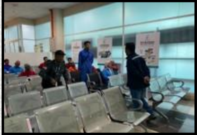
FELT CONTRACTOR MANAGEMENT KPSB 18.9.2023