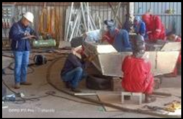
NOISE RISK ASSESSMENT (NEW AREA) PDSC 6.9.2023