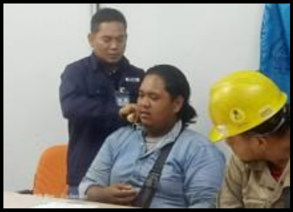
PROGRAM DERMA DARAH DI DMR 6.9.2023