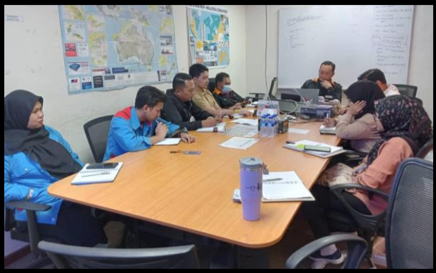
HSSE MONTHLY MEETING 7.12.2023