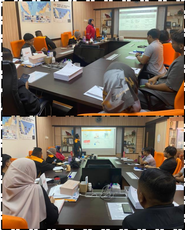
MARITIME CYBER SECURITY AWARENESS AA1 21.7.2024