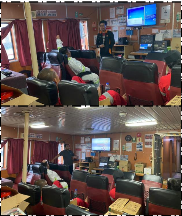
CYBER CRIME SECURITY (ONLINE SCAMMER) AWARENESS BY IPK TERENGGANU 25.7.2024