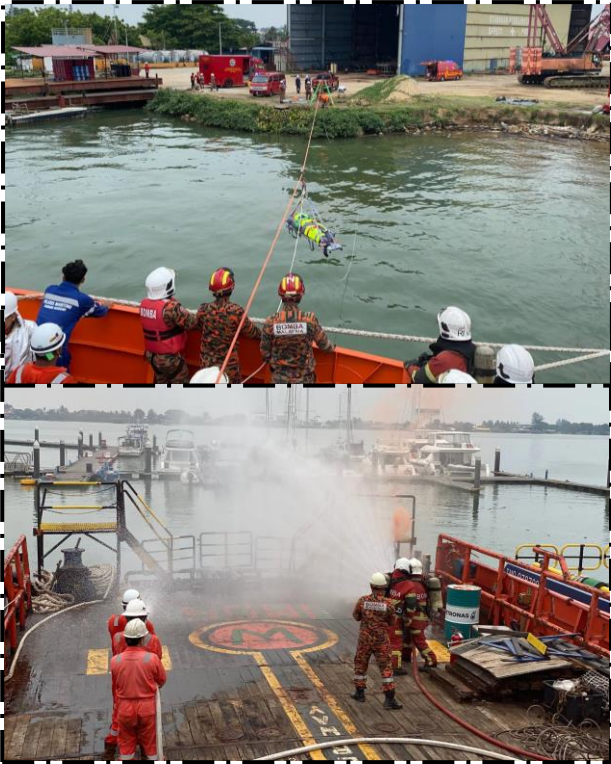
MASS INDUCTION 2/2024 13.7.2024