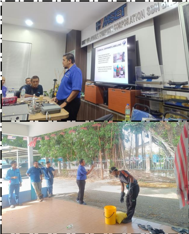
INTERNAL AUDIT ISM PL1 30.7.2024