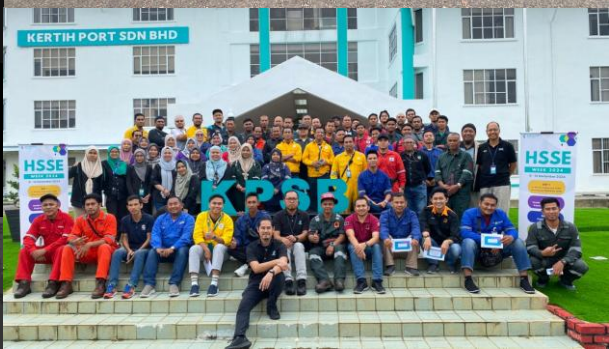
PERJUMPAAN & TAKLIMAT KESELAMATAN PEKERJA SUB-CON BERSAMA HSSE DI PDSC 17.12.2024