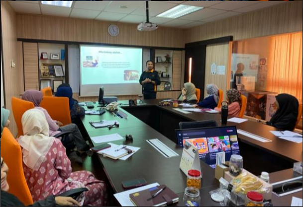
MONSOON ZIZA CAMPAIGN AA2 11.12.2024