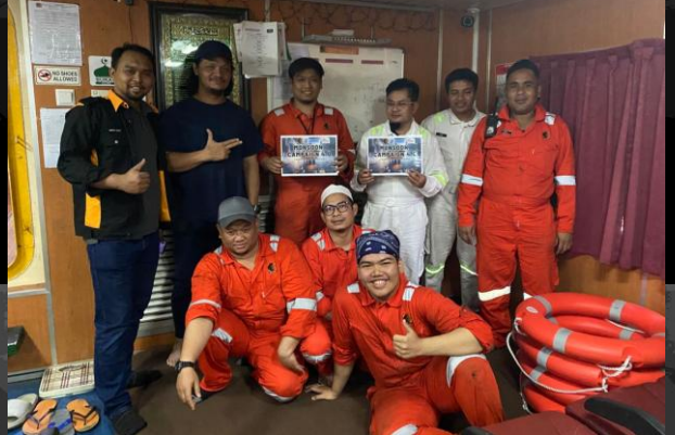
MANAGEMENT VISIT & HSE WEEK KPSB 12.12.2024