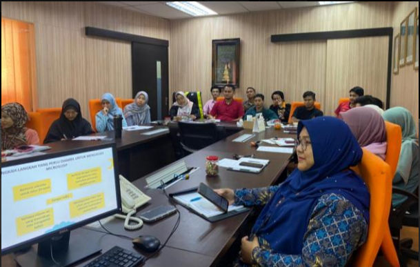
MONSOON CAMPAIGN 4.0 HQ 5.12.2024